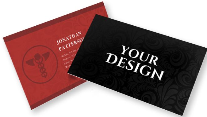
14pt Matte Finish Business Cards