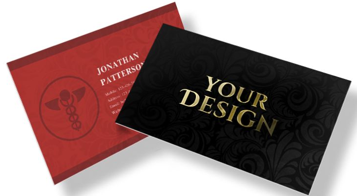
16pt Gold Foil Business Cards